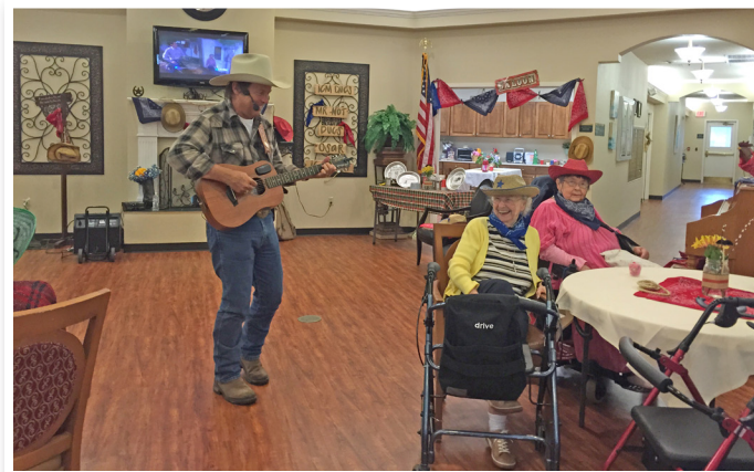
Rodeo Roundup Party